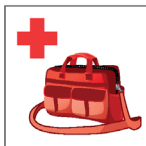
Medically Necessary and Diaper Bags*

*Infant and Medical supplies will be permitted after proper inspection.