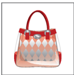
Printed Pattern Plastic Bag