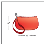
Bags smaller than 6"x 6"x 6"