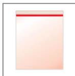
Tinted Plastic Bag