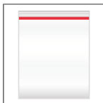
1-Gallon Plastic Freezer Bag