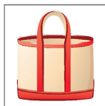
Over-sized Tote Bag