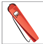
Folding Chair Bag (Folding Chair is Allowed)

FOR MORE INFORMATION GO TO PGATOUR.COM/ProhibitedItems